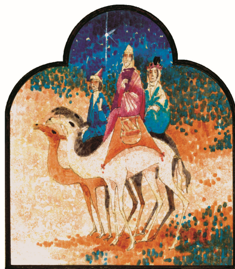
Unos sabios llegaron de oriente

Salmo responsorial: Leccionario Hispanoamericano Dominical © 1970, Comisión Episcopal Española. Usado con permiso. Todos los derechos reservados.